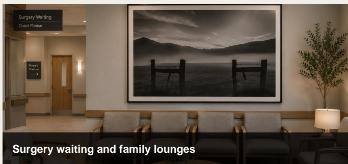
Surgery waiting and family lounges